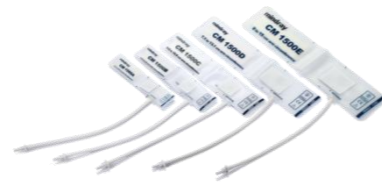
NIBP: Variety of cuffs fit multiple patient sizes