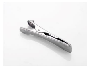
ECG: Non-traumatic alligator clips